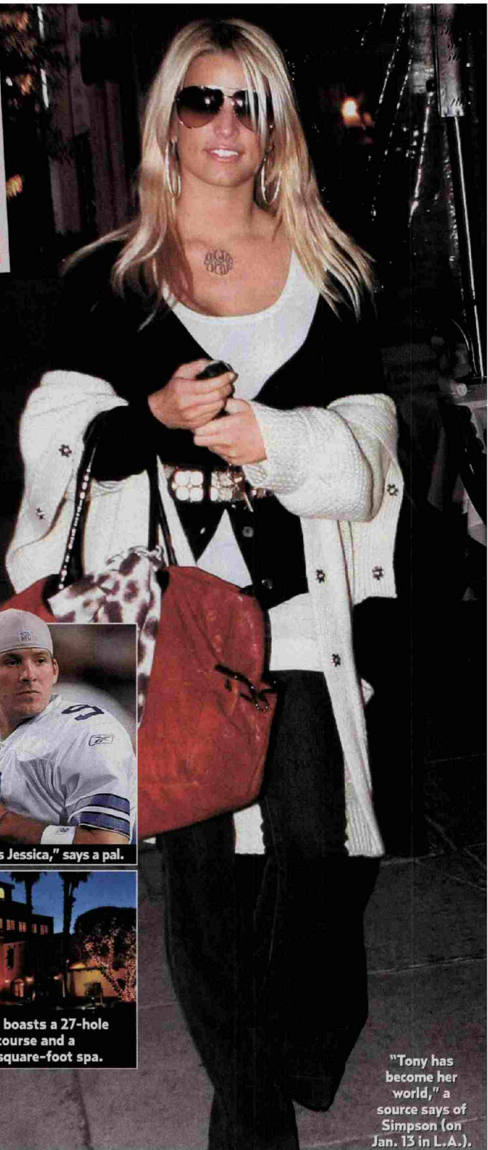
"Tony has become her world," a source says of Simpson (on Jan. 13 in L.A.).

Sound off on your favorite stars at Usmagazine.com