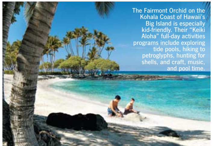
The Fairmont Orchid on the Kohala Coast of Hawaii’s Big Island is especially kid-friendly. Their “Keiki Aloha” full-day activities programs include exploring tide pools, hiking to petroglyphs, hunting for shells, and craft, music, and pool time.

goodies such as yo-yos and bath sponges, comment cards offer a rating scale from yummy to yucky, and “Guppy Love” gives kids a fishy friend during their stay. Rooms can also be child-proofed and concierge services for families include babysitting and stroller and child safety seat rentals. For more information call 800-546-7866 or visit www.kimptonhotels.com .